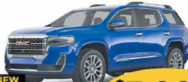
NEW 2024 GMC ACADIA $7,000 OFF