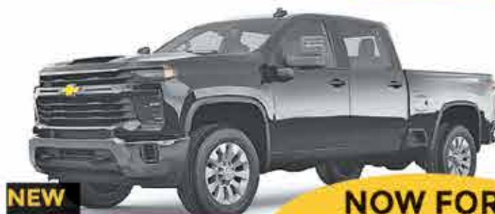
NEW 2024 CHEVROLET SILVERADO 2500 NOW FOR INVOICE PRICING!