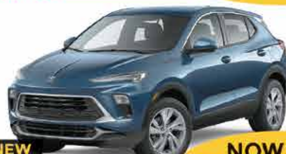
NEW 2024 BUICK ENCORE GS NOW FOR INVOICE PRICING!