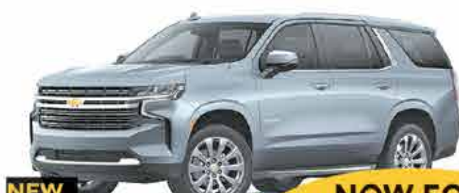
NEW 2024 CHEVROLET TAHOE/SUBURBAN NOW FOR INVOICE PRICING!