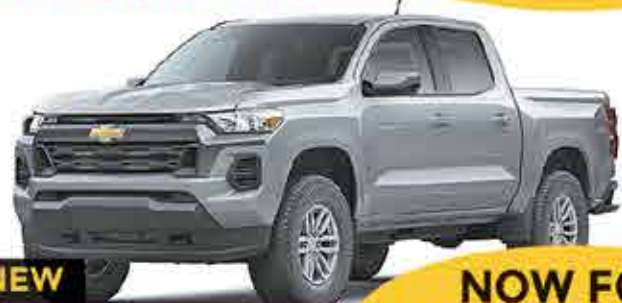
NEW 2024 CHEVROLET COLORADO NOW FOR INVOICE PRICING!