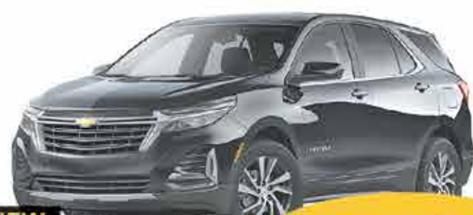
NEW 2024 CHEVROLET EQUINOX $5,500 OFF