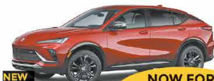
NEW 2024 BUICK ENVISTA NOW FOR INVOICE PRICING!