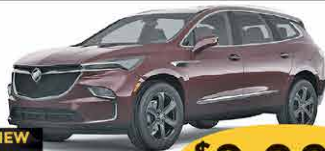
NEW 2024 BUICK ENCLAVE $8,000 OFF