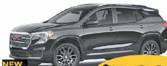
NEW 2024 GMC TERRAIN $5,000 OFF