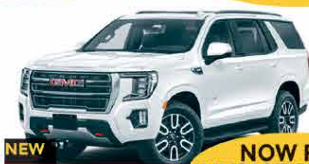
NEW 2024 GMC YUKON/ YUKON XL NOW FOR INVOICE PRICING!