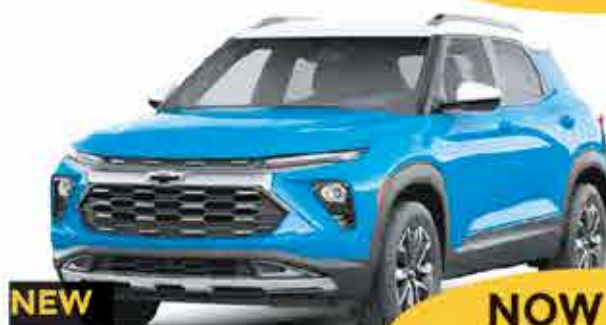
NEW 2024 CHEVROLET TRAILBLAZER NOW FOR INVOICE PRICING!