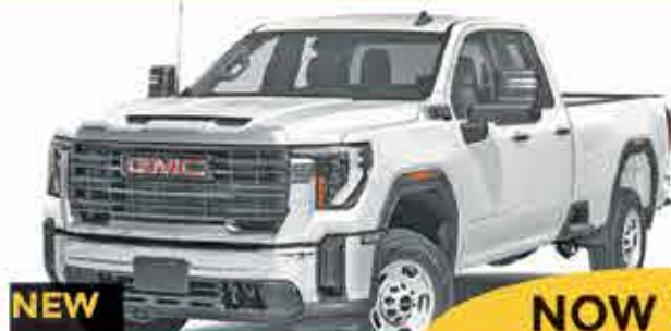
NEW 2024 GMC SIERRA 2500 HD NOW FOR INVOICE PRICING!