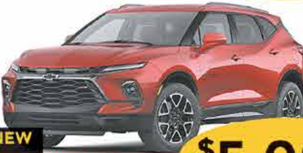
NEW 2024 CHEVROLET BLAZER $5,000 OFF