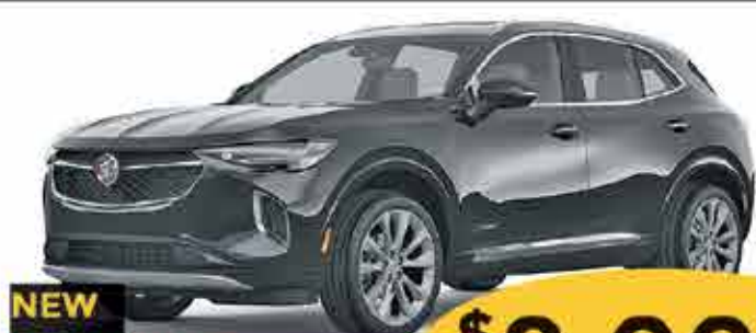
NEW 2023 BUICK ENVISION $8,000 OFF

•••• SERRA REALLY WILL SAVE YOU MONEY ON YOUR NEXT VEHICLE!! ••••