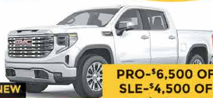
NEW 2024 GMC SIERRA 1500 SERIES PRO-$6,500 OFF SLE-$4,500 OFF SLT-$6,500 OFF DENALI-$7,500 OFF