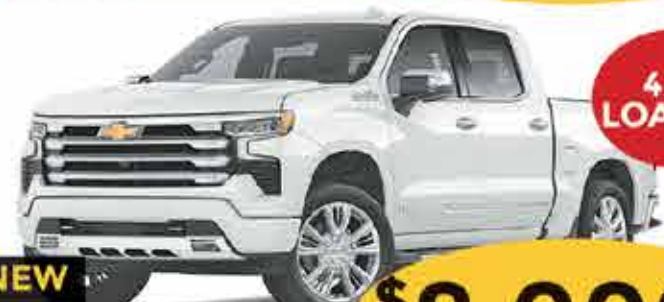
NEW 2024 CHEVROLET SILVERADO 1500 LT 4X4 LOADED $8,000 OFF