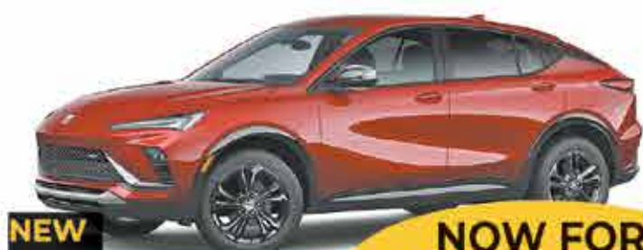
NEW 2024 BUICK ENVISTA NOW FOR INVOICE PRICING!