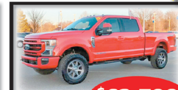
2022 FORD F-350 #4T34813A