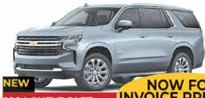
NEW 2024 CHEVROLET TAHOE/SUBURBAN NOW FOR INVOICE PRICING!