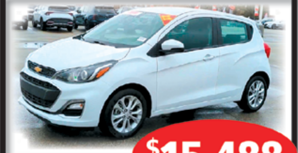
2022 CHEVROLET SPARK #P34962