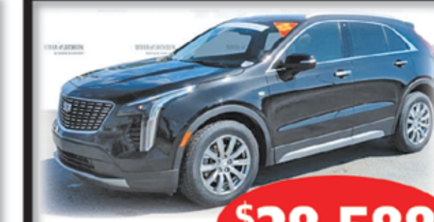
2023 CADILLAC XT4 #P34903