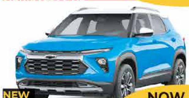
NEW 2024 CHEVROLET TRAILBLAZER NOW FOR INVOICE PRICING!