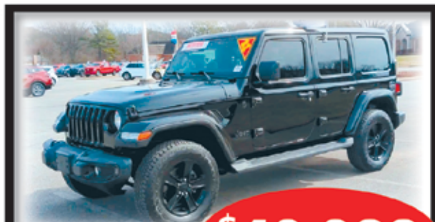
2021 JEEP WRANGLER #P34896