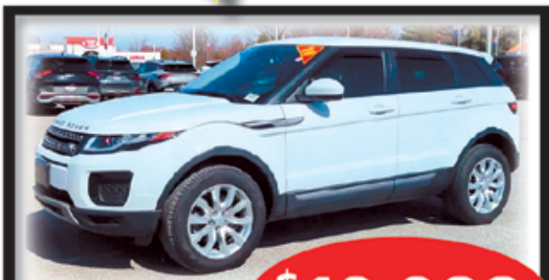
2019 LANDROVER RANGE ROVER #4KT93738