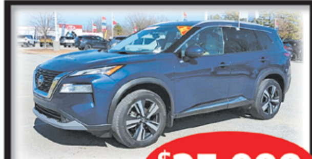
2021 NISSAN ROGUE #P34899