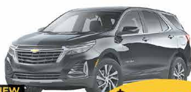
NEW 2024 CHEVROLET EQUINOX $5,500 OFF