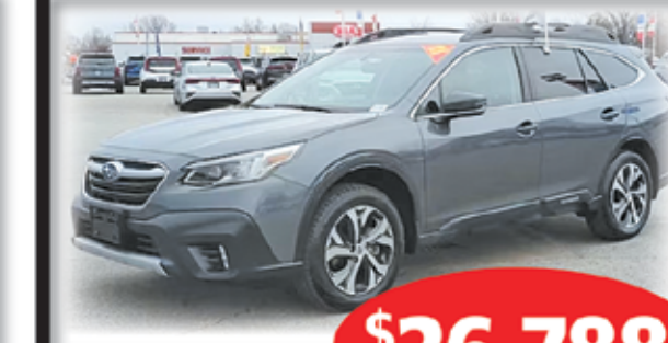
2021 SUBARU OUTBACK #P34574