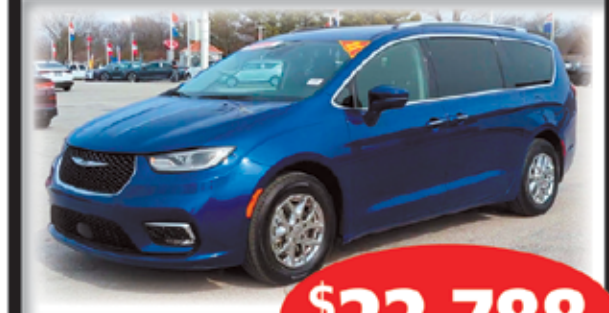
2021 CHRYSLER PACIFICA #P34845