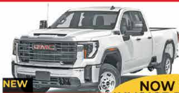
NEW 2024 GMC SIERRA 2500 HD NOW FOR INVOICE PRICING!