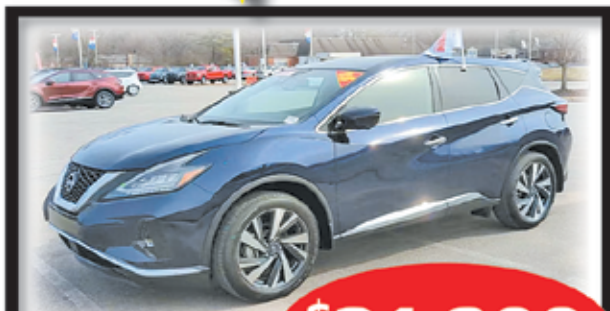
2023 NISSAN MURANO #P34897