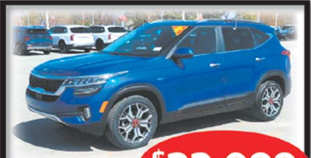
2021 KIA SELTOS #P34918