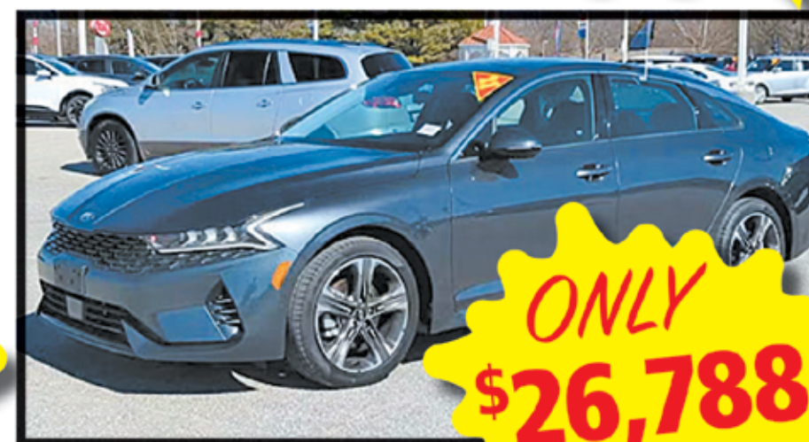
2021 KIA K5 #P34864