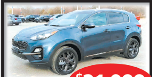
2021 KIA SPORTAGE #P34920