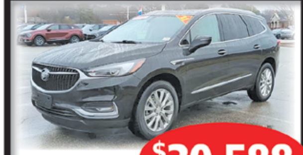
2021 BUICK ENCLAVE #P34923