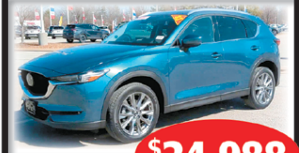
2021 MAZDA CX-5 #P34879