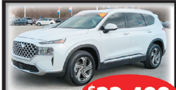
2022 HYUNDAI SANTA FE #4T34544A