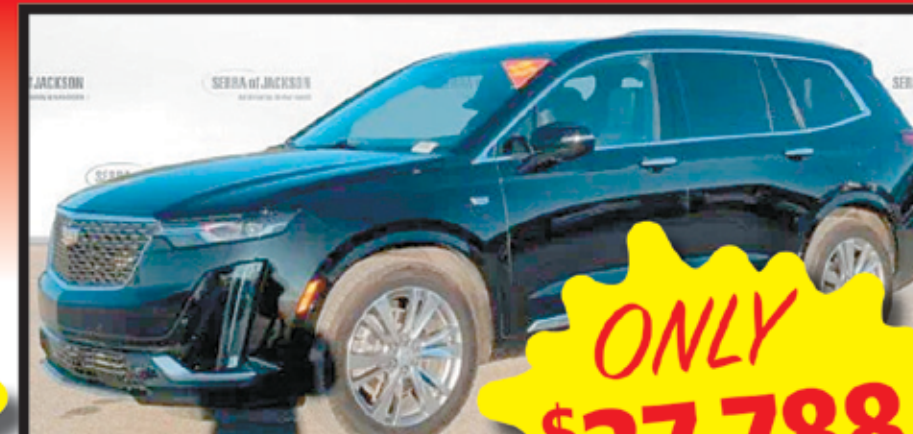
2023 CADILLAC XT6 #P34743