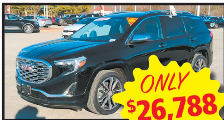
2020 GMC TERRAIN #P34774