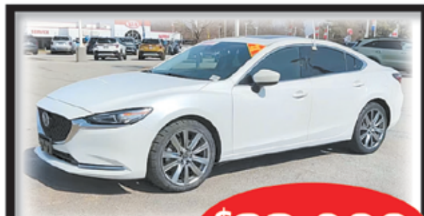
2021 MAZDA MAZDA6 #P34880