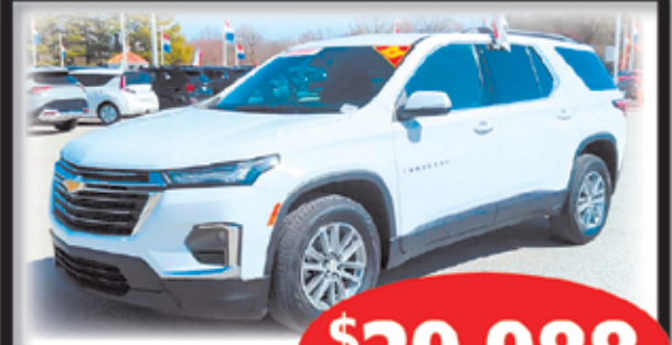
2023 CHEVROLET TRAVERSE #P34930