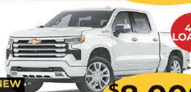
NEW 2024 CHEVROLET SILVERADO 1500 LT 4X4 LOADED $8,000 OFF