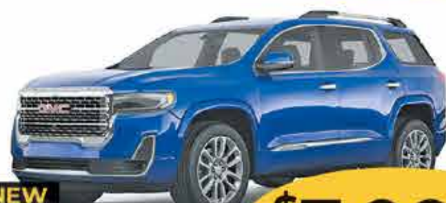
NEW 2024 GMC ACADIA $7,000 OFF