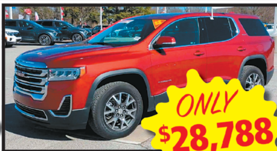
2023 GMC ACADIA #P34850