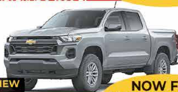
NEW 2024 CHEVROLET COLORADO NOW FOR INVOICE PRICING!