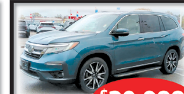
2019 HONDA PILOT #4KT9328A