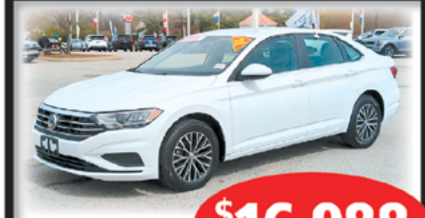
2021 VOLKSWAGON JETTA #P34961