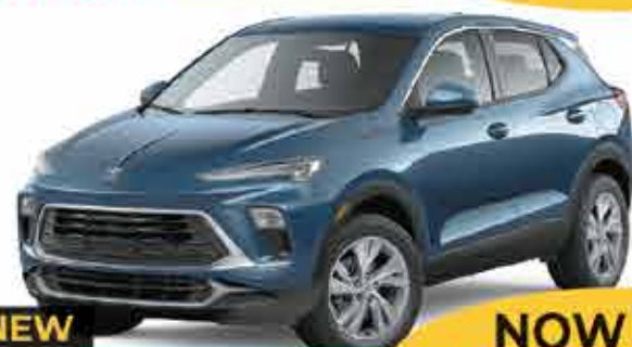
NEW 2024 BUICK ENCORE GS NOW FOR INVOICE PRICING!