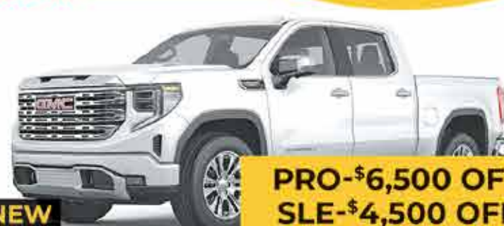
NEW 2024 GMC SIERRA 1500 SERIES PRO-$6,500 OFF SLE-$4,500 OFF SLT-$6,500 OFF DENALI-$7,500 OFF