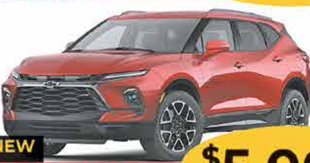
NEW 2024 CHEVROLET BLAZER $5,000 OFF