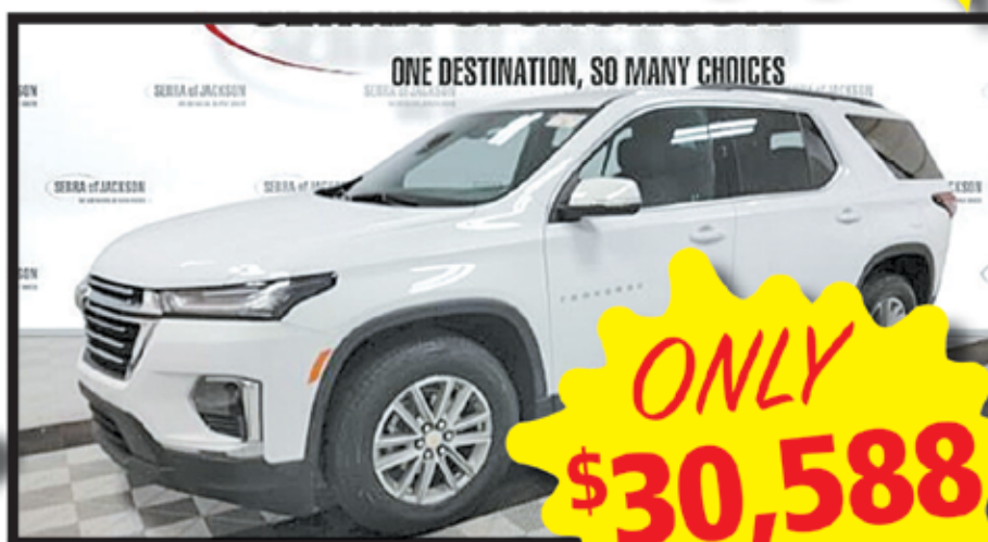
2023 CHEVROLET TRAVERSE #P34975