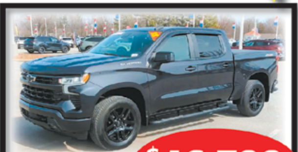
2022 CHEVROLET SILVERADO #P34893