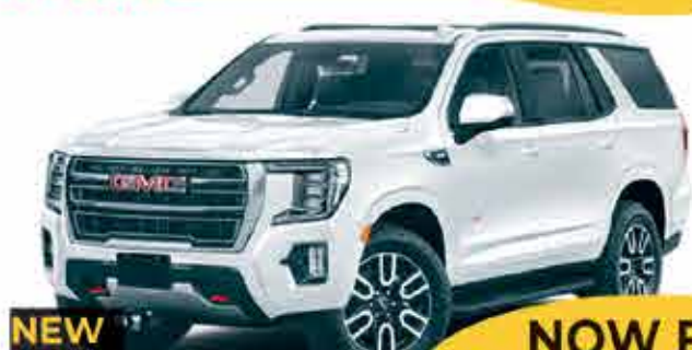
NEW 2024 GMC YUKON/ YUKON XL NOW FOR INVOICE PRICING!