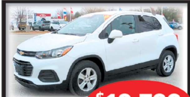
2021 CHEVROLET SPORT TRAX #P34964