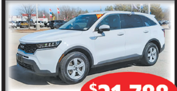
2022 KIA SORENTO #P34901