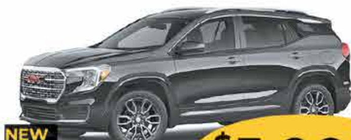
NEW 2024 GMC TERRAIN $5,000 OFF