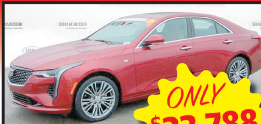
2023 CADILLAC CT4 #P34670