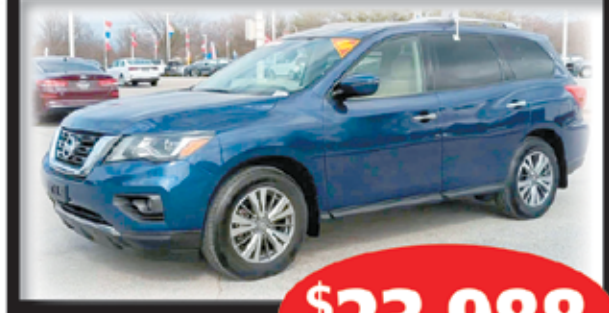
2020 NISSAN PATHFINDER #P34870