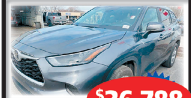
2023 TOYOTA HIGHLANDER #4T34738A