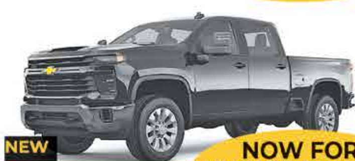
NEW 2024 CHEVROLET SILVERADO 2500 NOW FOR INVOICE PRICING!