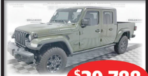
2023 JEEP GLADIATOR #P34895