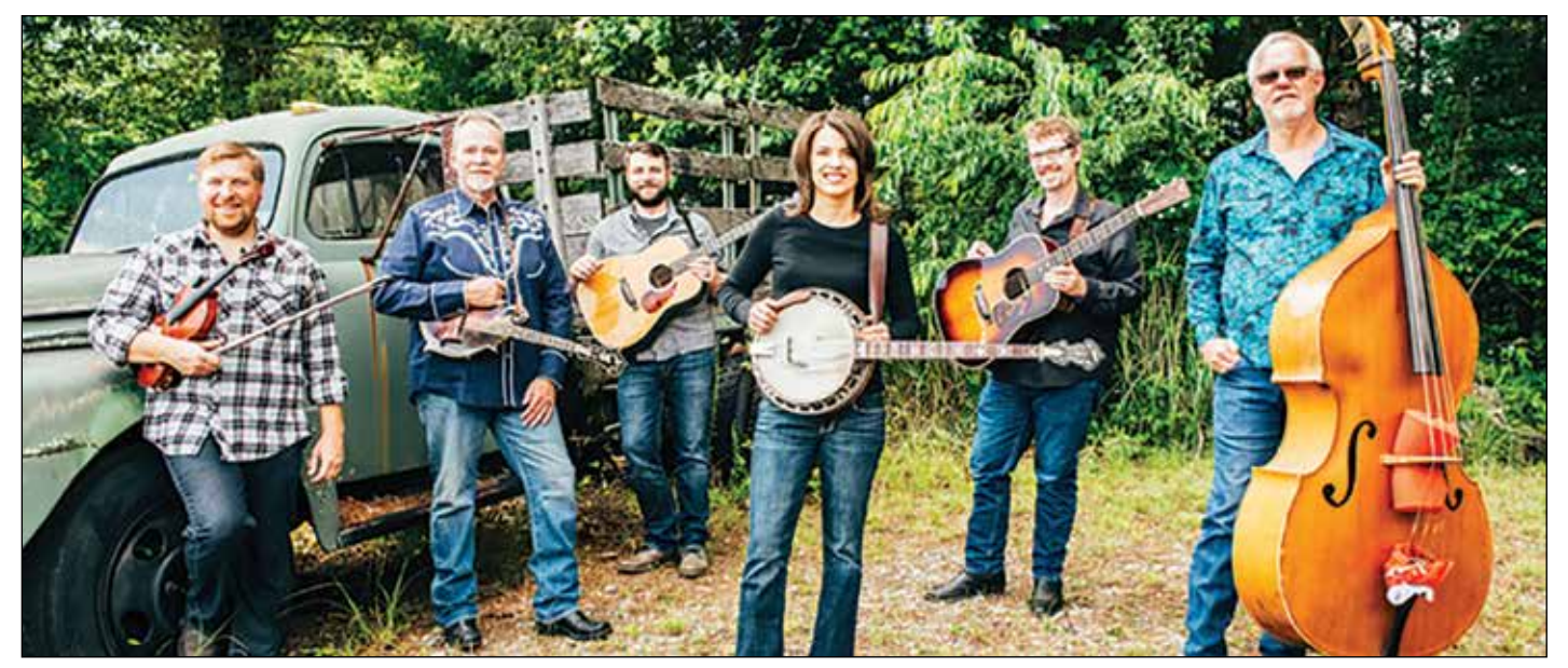
The Grasscals are one of the groups performing at The 45th Annual Savannah Bluegrass Festival.