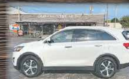
2017 KIA SORENTO EX #11118 ONLY $18,998