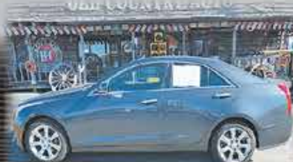
2015 CADILLAC ATS #11265 ONLY $17,988