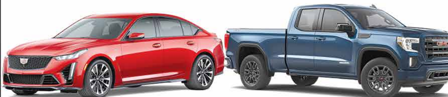
2022 Cadillac CT5 Loaded