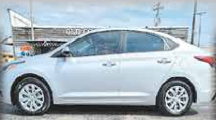
2019 HYUNDAI ACCENT SE #11268A ONLY $13,988