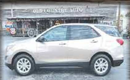
2019 CHEVROLET EQUINOX LS #11227 ONLY $17,988