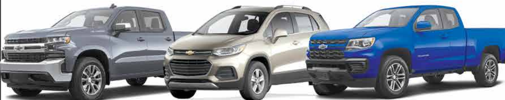
2022 Chevy Silverado 1500 Crew