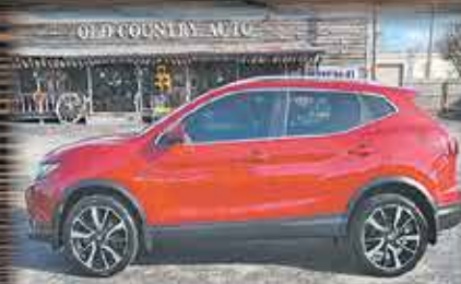
2017 NISSAN ROGUE SPORT SL #11252A ONLY $18,988