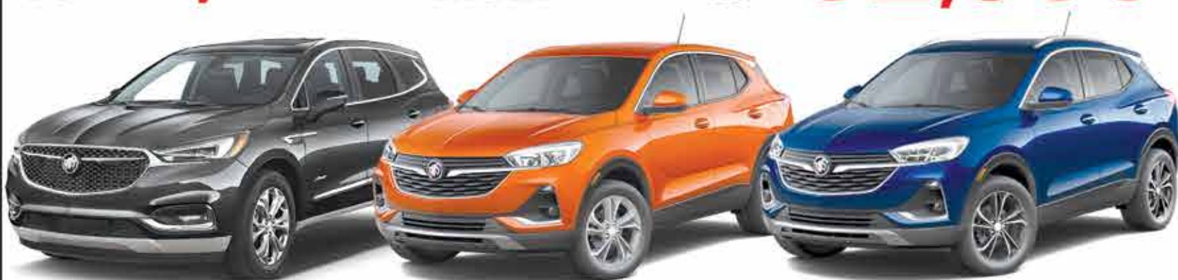
22 Buick Enclave

UP TO $5,000 OFF MSRP & AS LOW AS $32,590