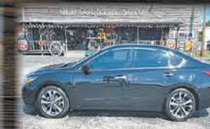
2017 NISSAN ALTIMA SR #11181 ONLY $17,998