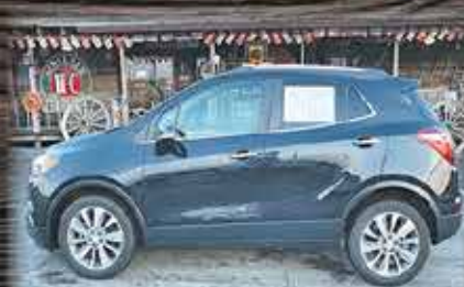
2018 BUICK ENCORE #11274 ONLY $17,988