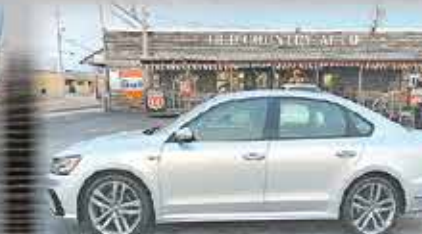
2018 VOLKSWAGEN PASSAT #11302 ONLY $15,988