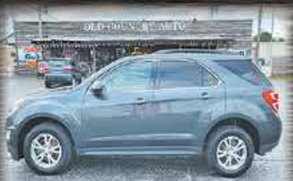
2017 CHEVROLET EQUINOX LT #11113 ONLY $16,998