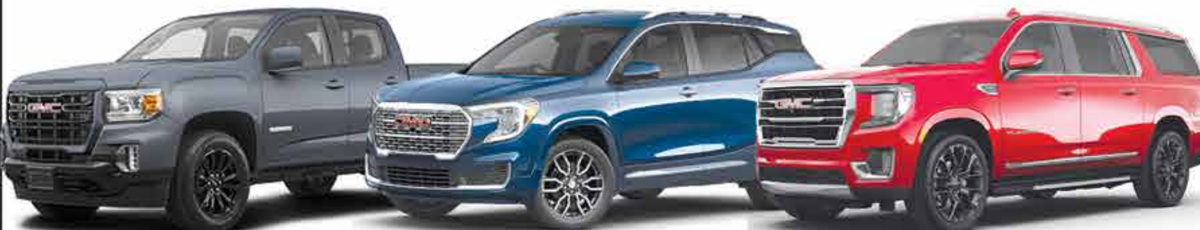
2022 GMC Canyon Elevation