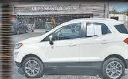
2020 FORD ECOSPORT #11148 ONLY $20,988