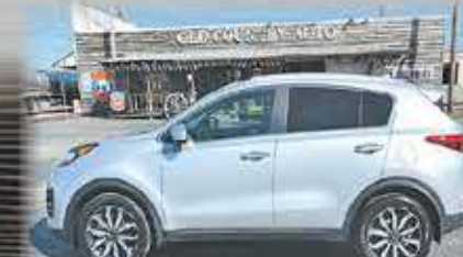
2017 KIA SPORTAGE EX #11059 ONLY $17,998