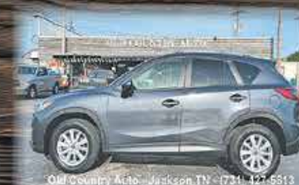
2016 MAZDA CX-5 TOURING #11103 ONLY $16,998