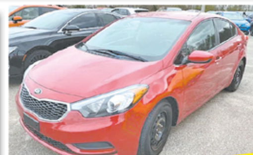
2016 KIA FORTE LX