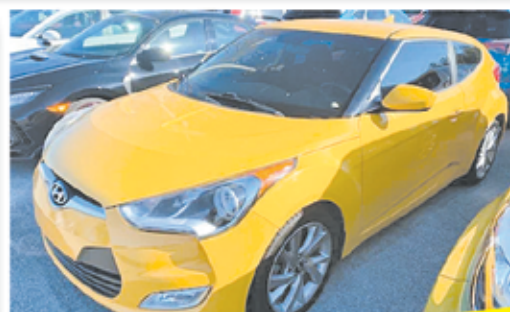
2017 HYUNDAI VELOSTER