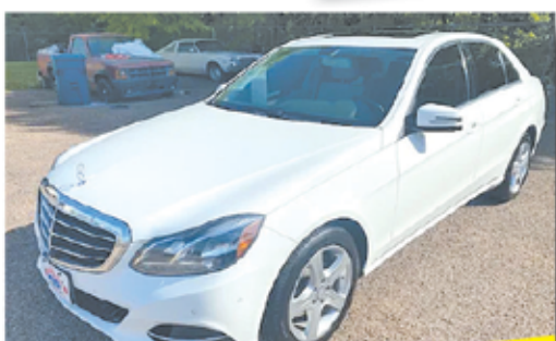
2014 MERCEDES- BENZ E 250