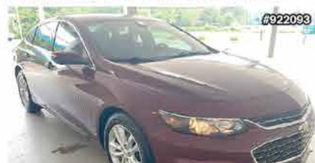
2016 CHEVY MALIBU LT SEDAN