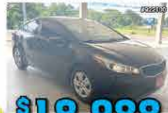
2017 KIA FORTE LX SEDAN