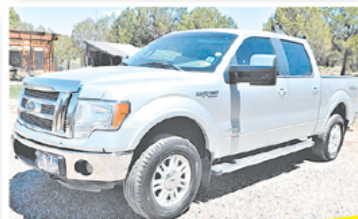
2011 FORD F-150