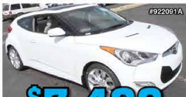
2012 HYUNDAI VELOSTER