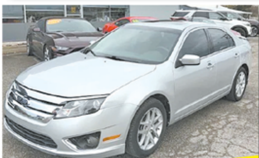
2010 FORD FUSION SEL