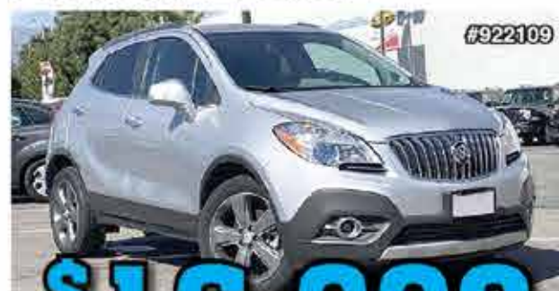
2014 BUICK ENCORE SUV