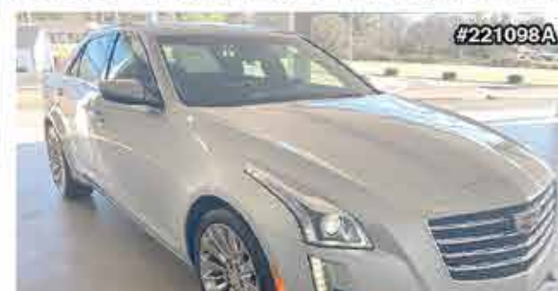
2018 CADILLAC CTS TURBO LUXURY