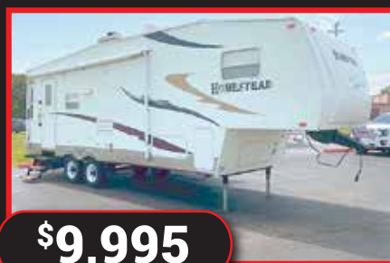
2006 STARCRAFT 270RLSS