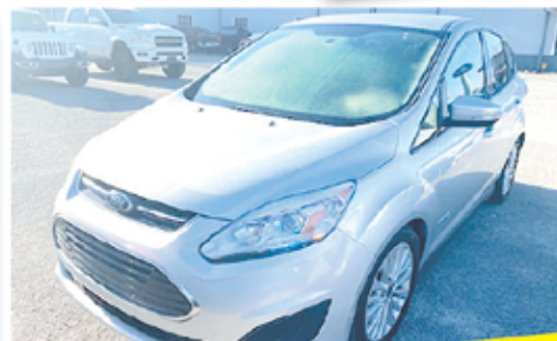
2018 FORD C-MAX HYBRID SE