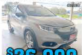
2020 HONDA HR-V EX SUV