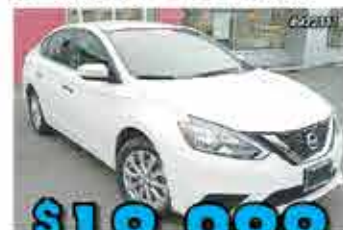
2019 NISSAN SENTRA S SEDAN