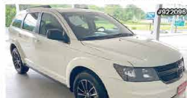
2019 DODGE JOURNEY SXT SUV