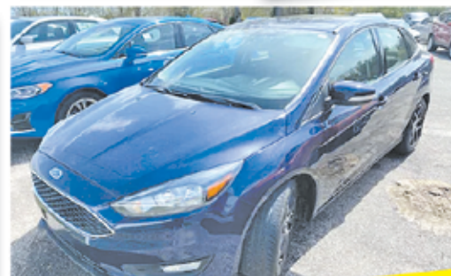
2017 FORD FOCUS SEL