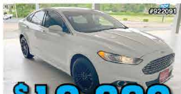
2014 FORD FUSION SE SEDAN

731-784-4500 • 3301 EAST END DR., HUMBOLDT, TN