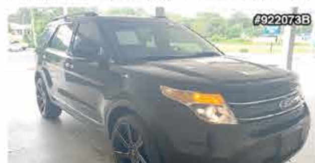
2013 FORD EXPLORER LIMITED