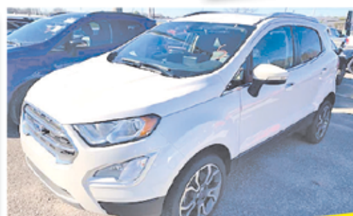
2018 FORD ECOSPORT