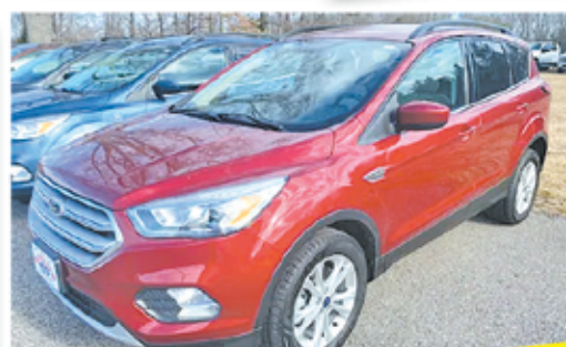
2018 FORD ESCAPE