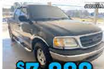
2003 FORD F-150 CREW CAB