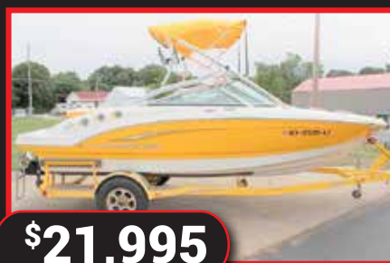
2010 CHAPARRAL 196 SSI