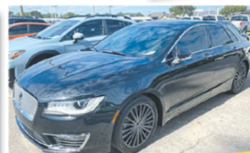
2017 LINCOLN MKZ RESERVE