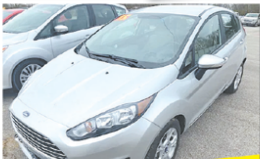
2015 FORD FIESTA SE