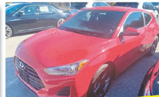
2019 HYUNDAI VELOSTER